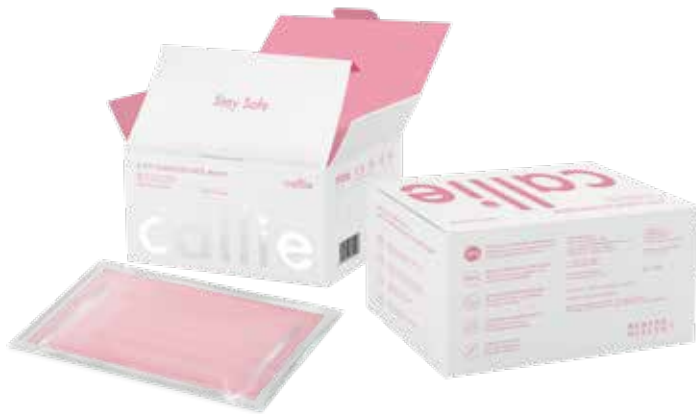
4 PLY SURGICAL FACE MASK (ADULT)