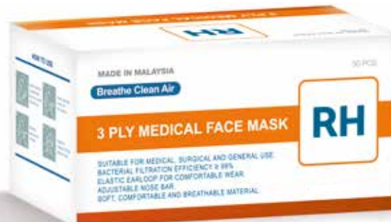
3 PLY MEDICAL FACE MASK (ADULT)