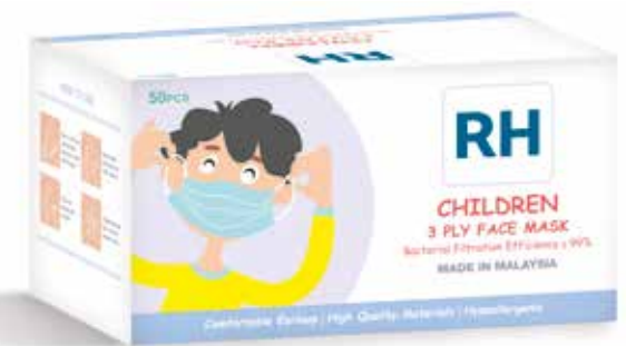
3 PLY FACE MASK (CHILDREN)