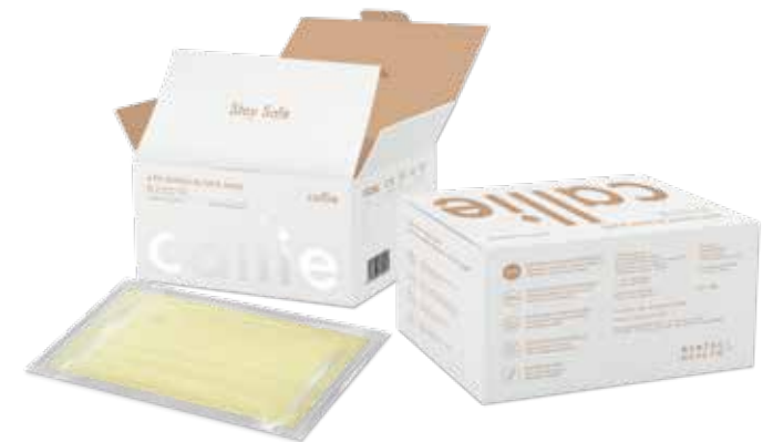
4 PLY SURGICAL FACE MASK (ADULT)