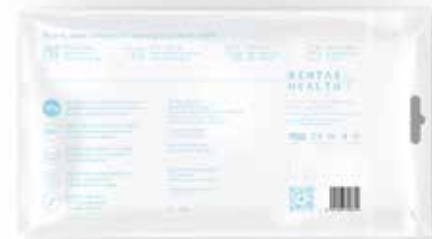
4 PLY SURGICAL FACE MASK (ADULT)