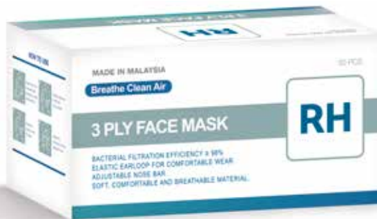
3 PLY FACE MASK (ADULT)