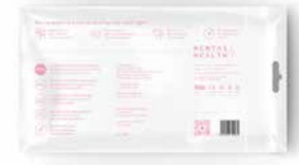
4 PLY SURGICAL FACE MASK (CHILDREN)