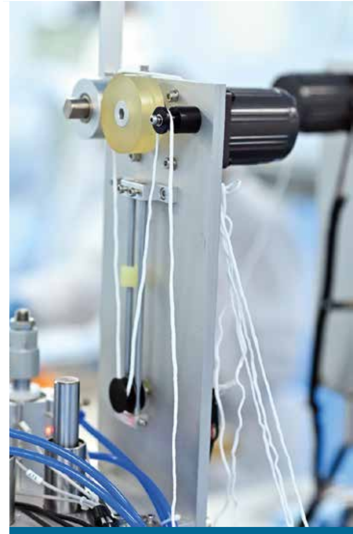
Earband Ultrasonic Welding