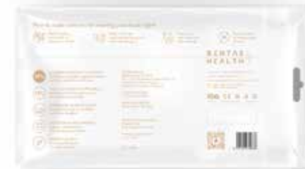
4 PLY SURGICAL FACE MASK (ADULT)