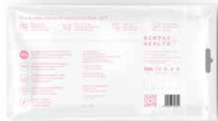
4 PLY SURGICAL FACE MASK (ADULT)