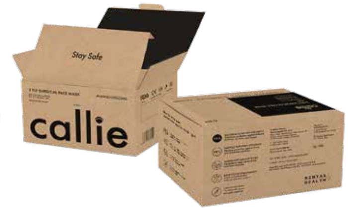
3 PLY SURGICAL FACE MASK (STUDENT - BLACK)