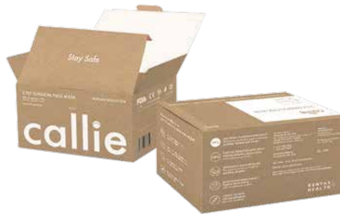
3 PLY SURGICAL FACE MASK (STUDENT - WHITE)