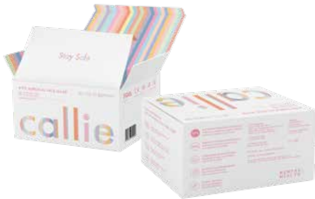
4 PLY SURGICAL FACE MASK (CHILDREN)