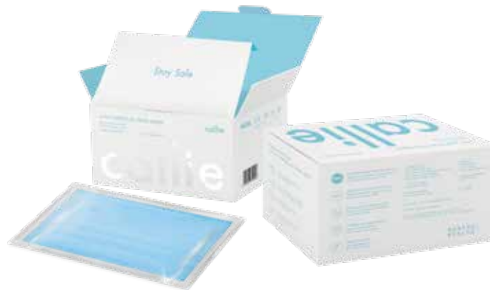
4 PLY SURGICAL FACE MASK (ADULT)